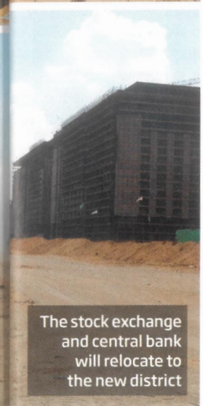
The stock exchange and central bank will relocate to the new district