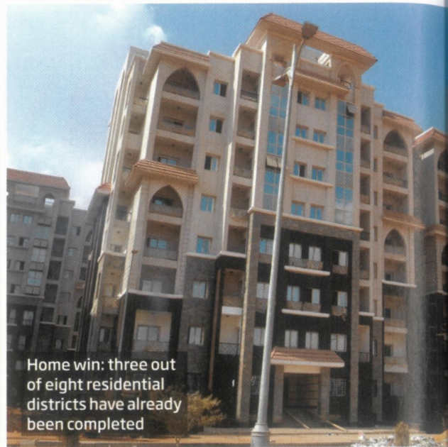
Home win: three out of eight residential districts have already been completed