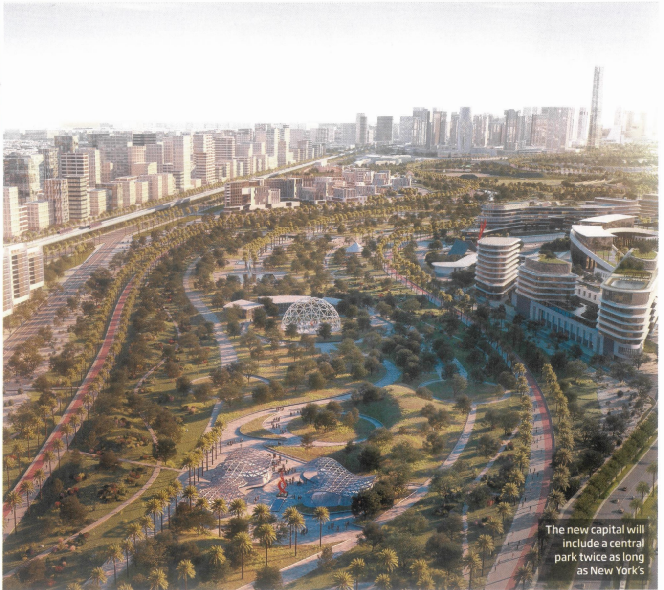
The new capital will include a central park twice as long as New York's

largest civil services, with around five million government employees," he says. "In Cairo alone, there are 2.1 million government employees; so the vast majority of them are not going to move."