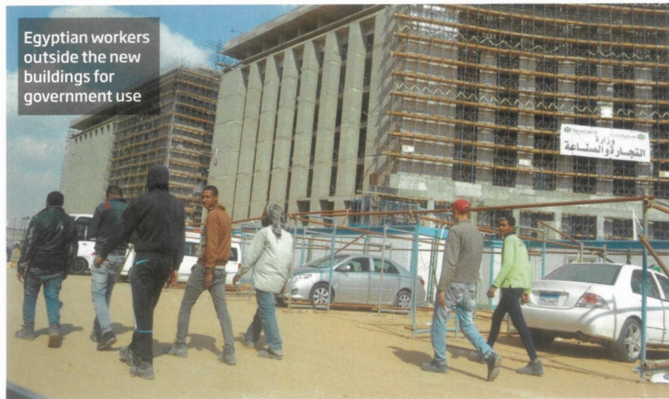
Egyptian workers outside the new buildings for government use