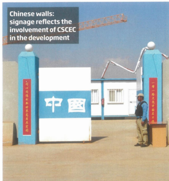
Chinese walls: signage reflects the involvement of CSCEC in the development

“Cairo is suffering with rapid urban migration and the